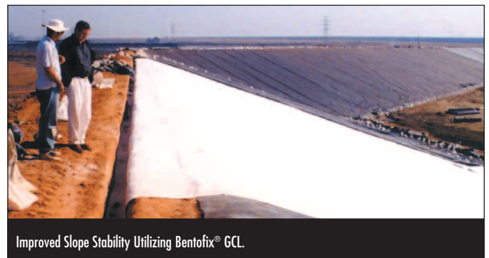
Improved Slope Stability Utilizing Bentofix® GCL.

With Bentofix® GCL, the clay component is no longer the limiting factor on side slopes. You can use Bentofix® GCL to replace compacted clay layers on steep side slopes and be assured of low permeability without sacrificing slope stability. The inherent confining stress from the needlepunching also improves the hydraulic properties of Bentofix® GCL under low confining stress applications.