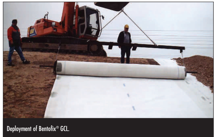
Deployment of Bentofix® GCL.

Simple, cost-effective installation techniques make Bentofix® GCL a practical alternative to a compacted clay liner for a wide range of applications, including composite landfill liners, landfill caps, secondary containment, storm water and waste water impoundments, as well as canals, dams and reservoirs.