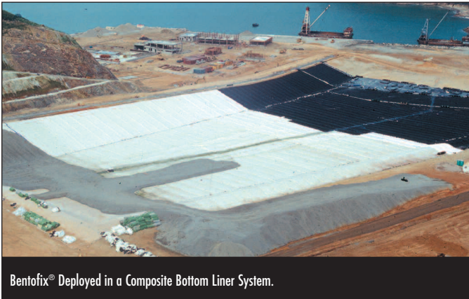
Bentofix® Deployed in a Composite Bottom Liner System.

The thorough manufacturing quality control minimizes the expensive and time consuming on-site quality assurance testing required for compacted clay liners. Bentofix® GCL provides consistent high quality performance.