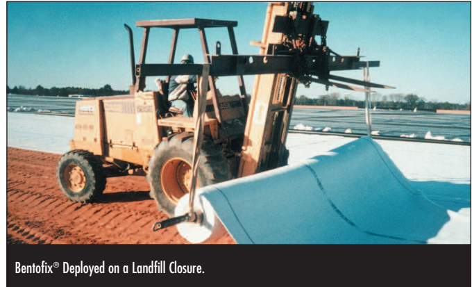
Bentofix® Deployed on a Landfill Closure.

deleterious effects of differential settlement and seasonal temperature fluctuations.